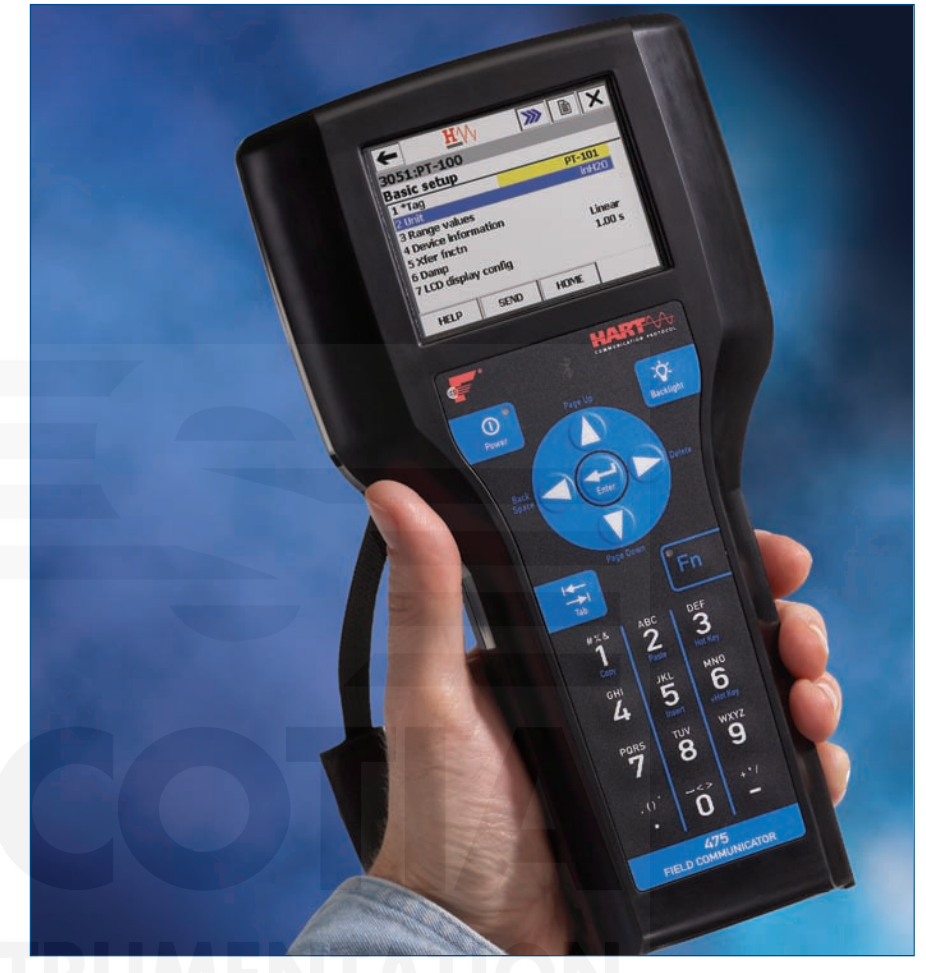
The 475 Field Communicator is designed to support all HART and FOUNDATION fieldbus devices from all vendors.