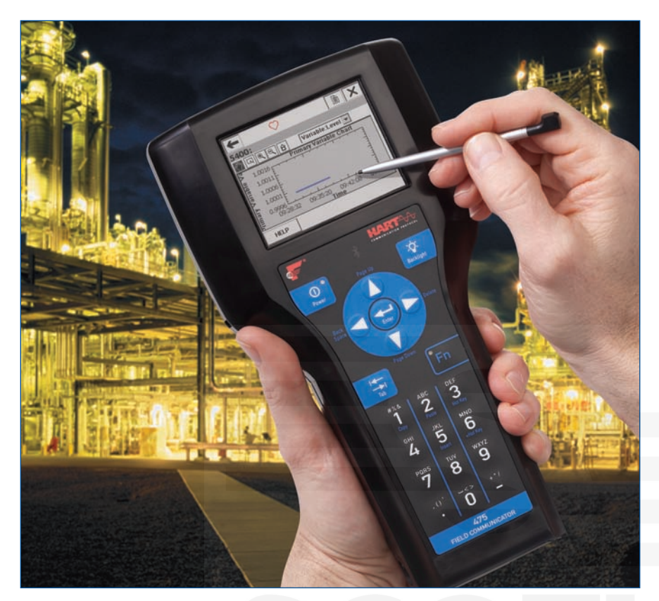
Designed not only for use on the bench, the 475 Field Communicator also enables you to do those tasks that just have to be done in the field.