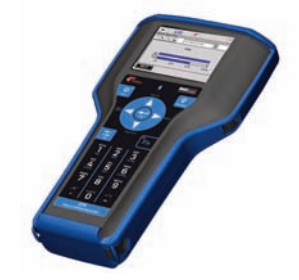
The protective rubber boot provides added protection in the field.

The 475 Field Communicator is designed, manufactured, and tested to very demanding specifications. It is ready to go wherever you need to go to get the job done.