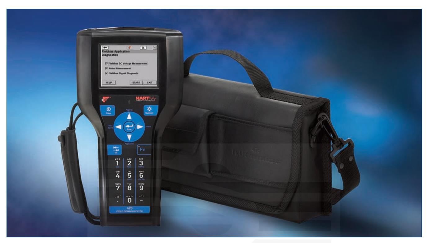
The 475 Field Communicator, with its handy carrying case, provides a single tool for configuring and diagnosing HART and FOUNDATION fieldbus devices.