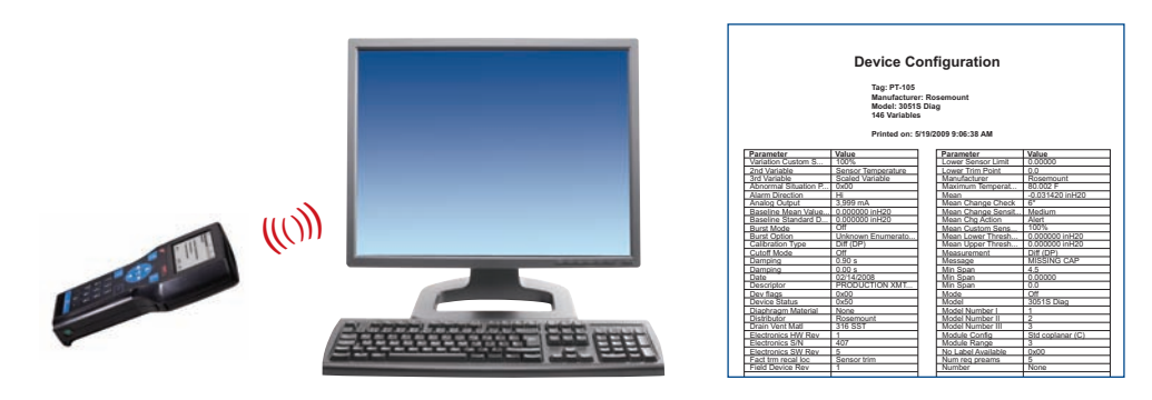
Easily store and print device configurations for analysis and documentation requirements.

Through Easy Upgrade , you always have access to the latest HART and fieldbus drivers. With the 475 Field Communicator, you are guaranteed universal HART and FOUNDATION fieldbus support in a single, intrinsically safe handheld communicator.