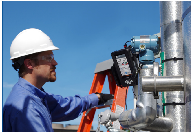
The magnetic hanger accessory allows you to attach the Trex unit to a pipe, freeing up your hands for other work.

AMS Inspection Rounds on AMS Trex digitizes information collected during inspection routes to drive operations and maintenance action. By delivering information to automation systems, personnel have accurate, real-time information that enables them to make better decisions. Graphical dashboards deliver insight into plant condition, helping prioritize action and highlighting critical safety issues.