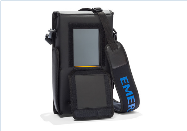
The useful carrying case protects your Trex unit in the field and provides storage options for accessory items.