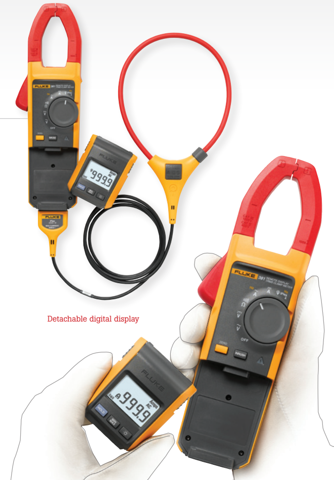
Detachable digital display