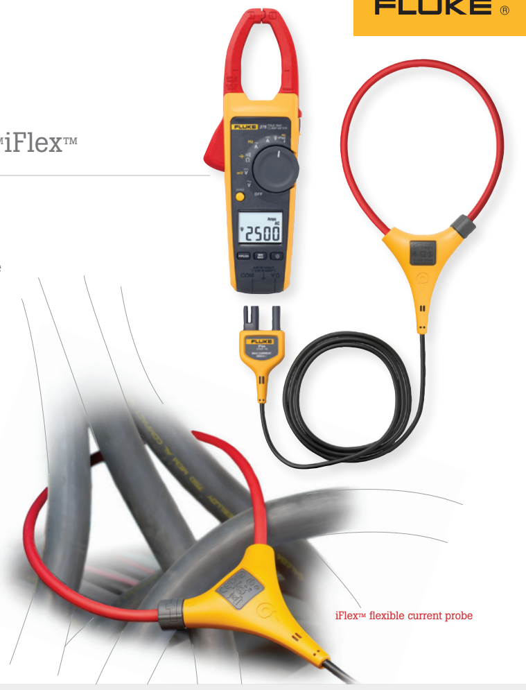
iFlex™ flexible current probe