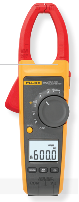
Compatible with the new iFlex™ attachment