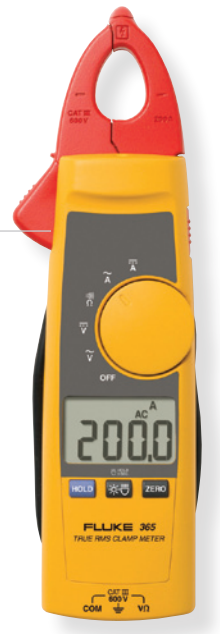
Features a small, detachable jaw