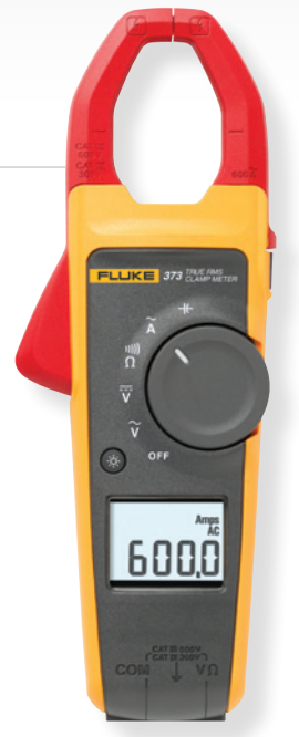
Large, backlight display improves viewing capabilities