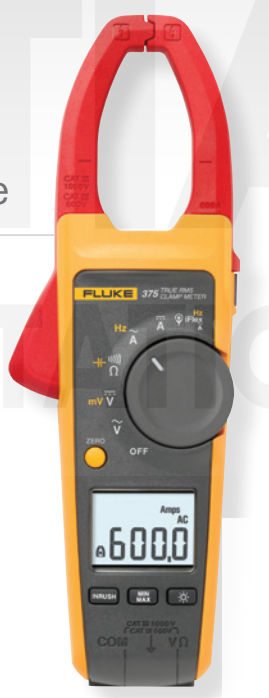
Advanced measurement features