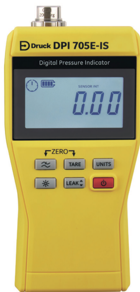
Hazardous Area Pressure Indicator

The Druck DPI 705E Series of handheld pressure and optional temperature indicators combine tough and rugged design with accurate and reliable measurements.