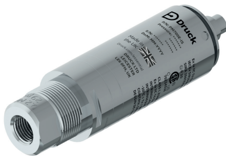
PM700E (Gauge, Absolute)