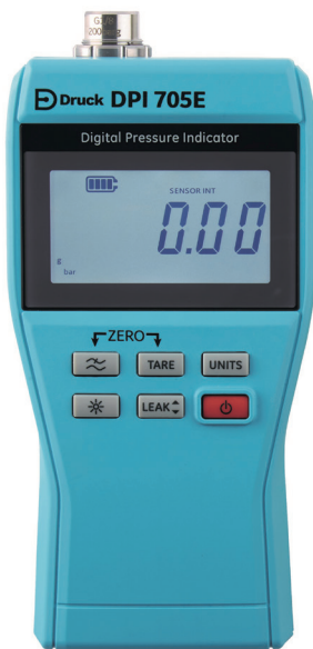
Safe Area Pressure Indicator