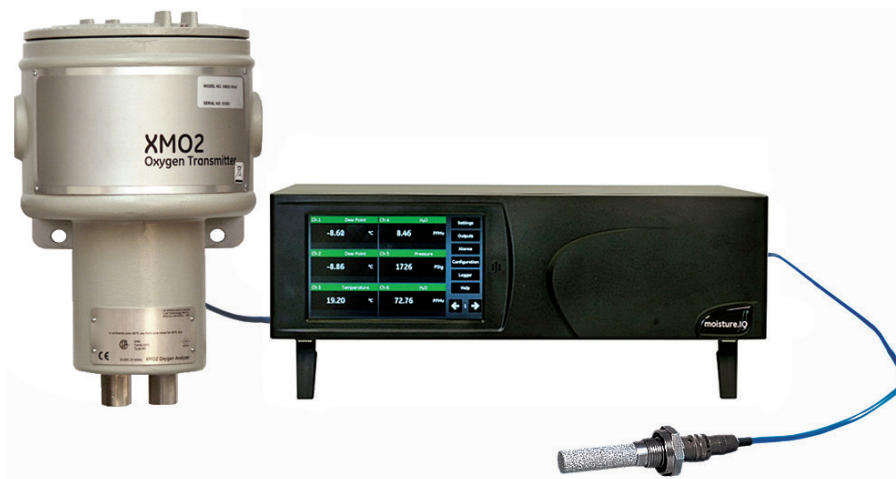
The XMO2 output may be used as an input to the Panametrics moisture.IQ analyzer for simultaneous measurement and display of both moisture and oxygen content.