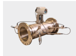
Sentinel LNG Buffered transducers for cryogenic measurement