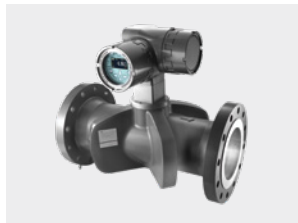
Sentinel LCT4 Optimized, cost-effective four-path design