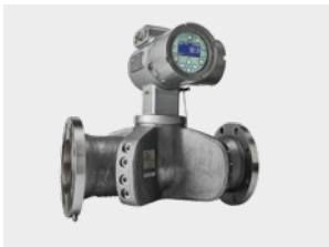
Sentinel LCT8 Eight-path accuracy under changing conditions