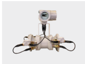
Sentinel LCT Buffered transducers for extended temperature range